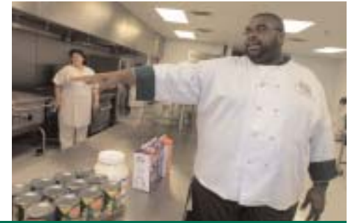
FROM THE FRONTLINES OF HUNGER:

The Food Bank helps member agencies in the outlying rural counties by delivering product on a regular basis. Many rural agencies do not have the staff or means to pick up food from the Food Bank.